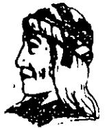
UGEWA BENDIUM TATEH

Oneidas bringing several hundred bags of corn to Washington's starving army at Valley Forge, after the colonists had consistently refused to aid them.