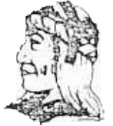
UGWA DEMOLUN TATENE Because of the help of this Oneida Chief in cementing a friendship between the six nations and the Colony of Pennsylvania, a new nation, the United States was made possible.