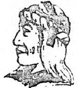
UGWA DINOLUH YATINE

Because of the help of this Oneida Chief in cementing a friendship between the six nations and the Colony of Pennsylvania, a new nation, the United States was made possible.