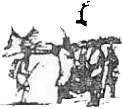
Oneidas bringing several hundred bags of corn to Washington's starving army at Valley Forge, after the colonists had consistently refused to aid