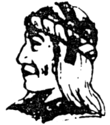
UGWA DEMOLUN TATENE Because of the help of this Oneida Chief in cementing a friendship between the six nations and the Colony of Pennsylvania, a new nation, the United States was made possible.