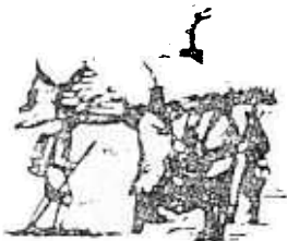
Onondagas bringing several hundred bags of corn to Washington's starving army at Valley Forge, after the colonists had consistently refused to aid them.