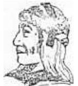
UGWA DEHOLUH YATENE Because of the help of this Oneida Chief in cementing a friendship between the six nations and the Colony of Pennsylvania, a new nation, the United States was made possible.