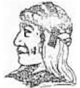
UGWA DEMOLUH YATENE Because of the help of this Oneida Chief in cementing a friendship between the six nations and the Colony of Pennsylvania, a new nation, the United States was made possible.