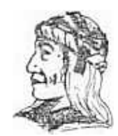
UGWA DEHOLUH YATENE Because of the help of this Oneida Chief in cementing a friendship between the six nations and the Colony of Pennsylvania, a new nation, the United States was made possible.