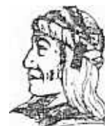
UGWA DEHOLUH YATEHE

Oneidas bringing several hundred bags of corn to Washington's starving army at Valley Forge, after the colonists had consistently refused to aid them.