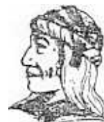
UGWA BENOLUH YATENE

Because of the help of this Oneida Chief in cementing a friendship between the six nations and the Colony of Pennsylvania, a new nation, the United States was made possible.