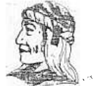
UGWA DEHOLUN YATEHE Because of the help of this Oneida Chief in cementing a friendship between the six nations and the Colony of Pennsylvania, a new nation, the United States was made possible.