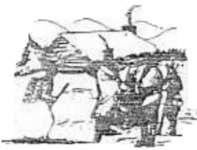
Onedias bringing several hundred bags of corn to Washington's starving army at Valley Forge, after the colonists had consistently refused to aid them.