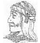
UGWA DEMOLUN YATHEE Because of the help of this Oneida Chief in cementing a friendship between the six nations and the Colony of Pennsylvania, a new nation, the United States was made possible.