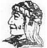
UGWA DEMOLUH YATEHE

Oneidas bringing several hundred bags of corn to Washington's starving army at Valley Forge, after the colonists had consistently refused to aid them.