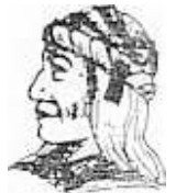
UGWA DEMOLUN YATENE

Approved as read on 5-2-83 Regular meeting