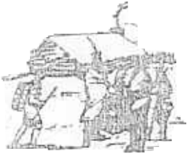
Onondagas bringing several hundred bags of corn to Washington's starving army at Valley Forge, after the colonists had consistently refused to aid them.