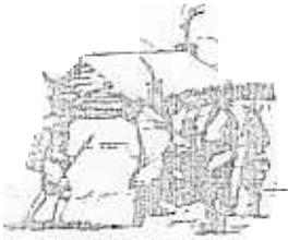
Onaidas bringing several hundred bags of corn to Washington's starving army at Valley Forge, after the colonists had consistently refused to aid them.