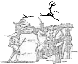
Onondagas bringing several hundred bags of corn to Washington's starving army at Valley Forge, after the colonists had consistently refused to aid them.