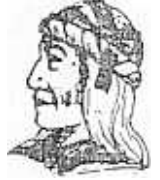
UGWA DEMOLUH YATEHE Because of the help of this Onondaga Chief in cementing a friendship between the six nations and the Colony of Pennsylvania, a new nation, the United States was made possible.