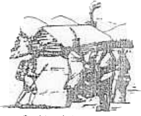
Onondaga bringing several hundred bags of corn to Washington's starving army at Valley Forge, after the colonists had consistently refused to aid them.