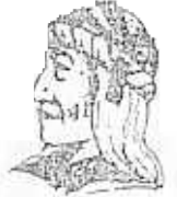
UGWA GENOLUN TATEKE Because of the help of this Oneida Chief in cementing a friendship between the six nations and the Colony of Pennsylvania, a new nation, the United States was made possible.