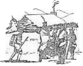
Oneidas bringing several hundred bags of corn to Washington's starving army at Valley Forge, after the colonists had consistently refused to aid them.