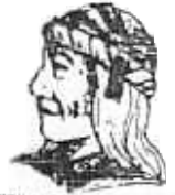
WAWA GENOLUN TATEHE Because of the help of this Oneida Chief in cementing a friendship between the six nations and the Colony of Pennsylvania, a new nation, the United States was made possible.