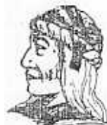
UGWA DEHOLUH YATEHE Because of the help of this Oneida Chief in cementing a friendship between the six nations and the Colony of Pennsylvania, a new nation, the United States was made possible.

Approved & Read Regular Meeting August 16, 1982