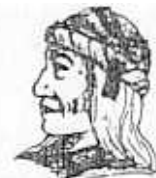
UGWA DEMOLUN YATEKE Because of the help of this Oneida Chief in cementing a friendship between the six nations and the Colony of Pennsylvania, a new nation, the United States was made possible.

Approved by Board Regular Meeting August 16/1982