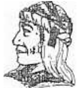
UGWA DEHOLUN YATENE

Approved AS lead Regular Meeting August 16, 1982