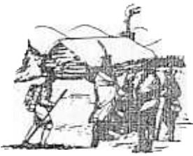
Oneidas bringing several hundred bags of corn to Washington's starving army at Valley Forge, after the colonists had consistently refused to aid them.