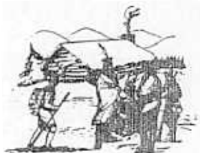
Onondagas bringing several hundred bags of corn to Washington's starving army at Valley Forge, after the colonists had consistently refused to aid them.