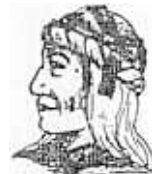
UGWA DEHOLUH YATENE Because of the help of this Oneida Chief in cementing a friendship between the six nations and the Colony of Pennsylvania, a new nation, the United States was made possible.

Approved at Regular Meeting August 16, 1982