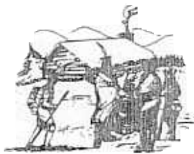
Oneidas bringing several hundred bags of corn to Washington's starving army at Valley Forge, after the colonists had consistently refused to aid them.