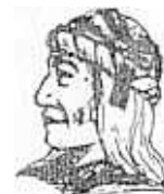
UGWA DEMOLUN YATENE Because of the help of this Oneida Chief in cementing a friendship between the six nations and the Colony of Pennsylvania, a new nation, the United States was made possible.