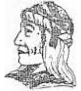
UGWA DEMOLUH YATENE