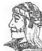
UGWA DEHOLUH YATEHE Because of the help of this Oneida Chief in cementing a friendship between the six nations and the Colony of Pennsylvania, a new nation, the United States was made possible.