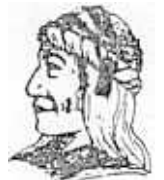
UGWA DEMOLUN YATENE Because of the help of this Oneida Chief in cementing a friendship between the six nations and the Colony of Pennsylvania, a new nation, the United States was made possible.