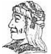
UGWA DENDLUH YATENE Because of the help of this Oneida Chief in cementing a friendship between the six nations and the Colony of Pennsylvania, a new nation, the United States was made possible.