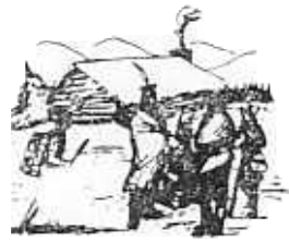
Oneidas bringing several hundred bags of corn to Washington's starving army at Valley Forge, after the colonists had consistently refused to aid them.