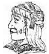
UGWA DEHOLUN YATEHE Because of the help of this Oneida Chief in cementing a friendship between the six nations and the Colony of Pennsylvania, a new nation, the United States was made possible.