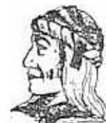
UGWA DEHOLUH YATEHE Because of the help of this Oneida Chief in cementing a friendship between the six nations and the Colony of Pennsylvania, a new nation, the United States was made possible.