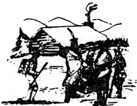
Onondas bringing several hundred bags of corn to Washington's starving army at Valley Forge, after the colonists had consistently refused to aid them.