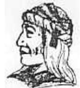
UGWA DEHOLUH YATEHE

Oneidas bringing several hundred bags of corn to Washington's starving army at Valley Forge, after the colonists had consistently refused to aid them.