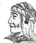
UGWA DEHLOHU TATEHE

Because of the help of this Oneida Chief in cementing a friendship between the six nations and the Colony of Pennsylvania, a new nation, the United States was made possible.