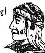
UGWA DEHOLUH YATEHE

Because of the help of this Oneida Chief in cementing a friendship between the six nations and the Colony of Pennsylvania, a new nation, the United States was made possible.