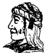
UGWA DEHOLUH YATEHE

Because of the help of this Oneida Chief in cementing a friendship between the six nations and the Colony of Pennsylvania, a new nation, the United States was made possible.