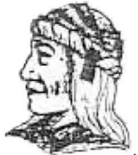
UGWA DEMOLUH YAT

Because of the honor of this Oneida Chief in cementing a friendship between the six nations and the Colony of Pennsylvania, a new nation, the United States was made possible.