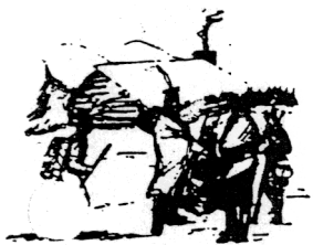
Onondas bringing several hundred bags of corn to Washington's starving army at Valley Forge, after the colonists had consistently refused to aid them.