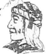
UGWA DEMOLUN YATEHE