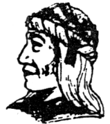
UGWA DENOLUN TATEHE