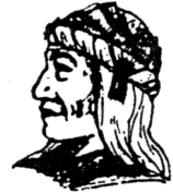
UGWA DENOLUN YATENE

Because of the help of this Onondaga Chief in cementing a friendship between the six nations and the Colony of Pennsylvania, a new nation, the United States was made possible.