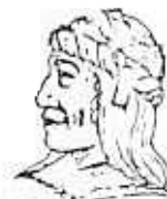
UGWA DEHOLUH YATEHE

Because of the help of this Oneida Chief in cementing a friendship between the six nations and the Colony of Pennsylvania, a new nation, the United States was made possible.