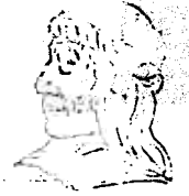
UGWA DEHOLUK YATHEE

Because of the help of this Oneida Chief in cementing a friendship between the six nations and the Colony of Pennsylvania, a new nation, the United States was made possible.