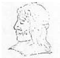
UGWA GENGUN YATHE Because of the help of this Oneida Chief in cementing a friendship between the Six Nations and the Colony of Pennsylvania, a new nation, the United States was made possible.

REGULAR MONTHLY MEETING ONEIDA BUSINESS COMMITTEE APRIL 15, 1974 8:00 p.m.