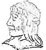
UGWA DEHOLUH YATEHE Because of the help of this Oneida Chief in cementing a friendship between the six nations and the Colony of Pennsylvania, a new nation, the United States was made possible.