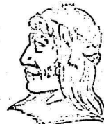
UGWA DEHOLUH YATENE

SPECIAL MEETING ONEIDA TRIBAL BUSINESS COMMITTEE JANUARY 10, 1974