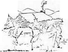
Illustration of a Native American man on a horse, holding a bow and arrow, with a small building in the background.