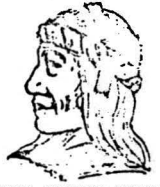
UGWA DEMOLUH YATENE

Because of the help of this Oneida Chief in cementing a friendship between the six nations and the Colony of Pennsylvania, a new nation, the United States was made possible.