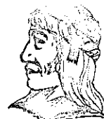
UGWA DEROLUH YATEHE

Because of the help of this Oneida Chief in cementing a friendship between the six nations and the Colony of Pennsylvania, a new nation, the United States was made possible.