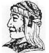
UGWA DEMOLUN YATENE

Because of the help of this Oneida Chief in cementing a friendship between the six nations and the Colony of Pennsylvania, a new nation, the United States was made possible.