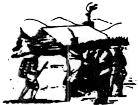
Oneidas bringing several hundred bags of corn to Washington's starving army at Valley Forge. after the colonists had consistently refused to aid them