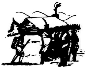
Oneidas bringing several hundred bags of corn to Washington's starving army at Valley Forge, after the colonists had consistently