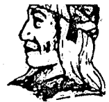
UGWA DENOLUM YATENE

...idas bringing sev- hundred bags of to Washington's ing army at Val- Forge, after the ists had consist- refused to aid