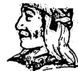
UGWA DEMOLUH TATENE

Oneidas bringing several hundred bags of flour to Washington's army at Valley Forge, after the British had consistently refused to aid them.