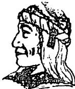
UGWA DEMOLUN YATEI

Because of the high of this Ch in cement ship between the nations and the Cole of Pennsylvania, a nation, the United States was made possible.