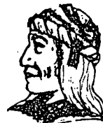
UGWA DEHOLUN YATENE

Because of the help of this Oneida Chief in cementing a friendship between the Six Nations and the Colony of Pennsylvania, a new nation, the United States was made possible.